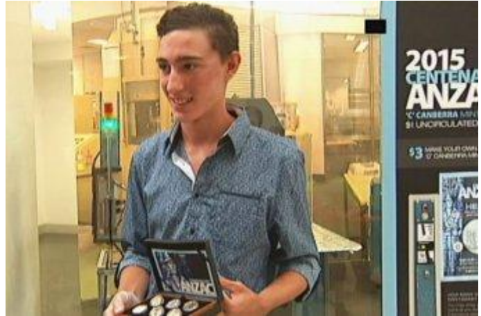
Photo: The 2015 coin was designed to commemorate the centenary of World War I. (ABC News)

"I won't be letting go of the coin anytime soon."